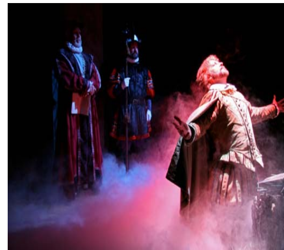
Sir Walter Raleigh faces his execution in “Shepherd of the Ocean”

It is co-sponsored by the First Colony Foundation, Elizabeth R. Company, Outer Banks History Center, Friends of Outer Banks History Center, NC Dept. Cultural Resources and the National Park Service.